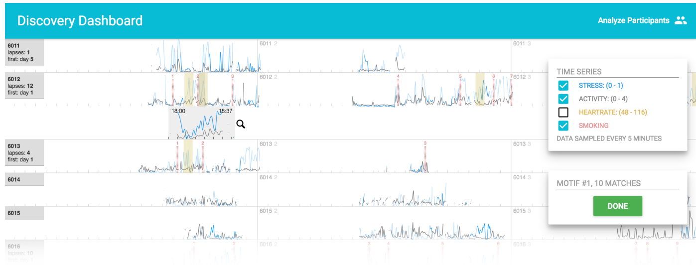
Figure 1: The Discovery Dashboard interface showing data from a mobile sensor study. Each row corresponds to one participant's data. A user-defined motif (for participant 6012) is selected, and the system automatically finds similar motifs across all participants and highlights them in yellow. This particular motif is a recurring pattern for participant 6012, often found near smoking lapses (vertical red dotted lines).